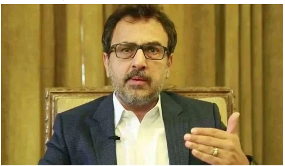
Federal Minister for Energy (Power Division) Awais Leghari gestures during an interview in this photo.

ISLAMABAD: Federal Minister for Energy Awais Khan Leghari has said Prime Minister Shehbaz Sharif would soon announce a reduction in power tariff, arguing that the government has saved Rs1,400 billion in the remaining years of revised contracts of independent power producers (IPPs).